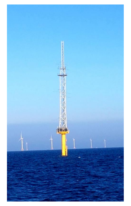
Figure 1 – Photograph of the Meteorological Mast

Updates on when the repair works will take place and the vessel(s) involved in the work will be provided through future NtMs.