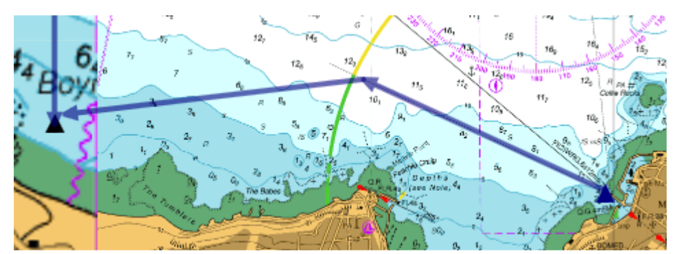
Figure 2 – Daily transit routes from Macduff base port to site