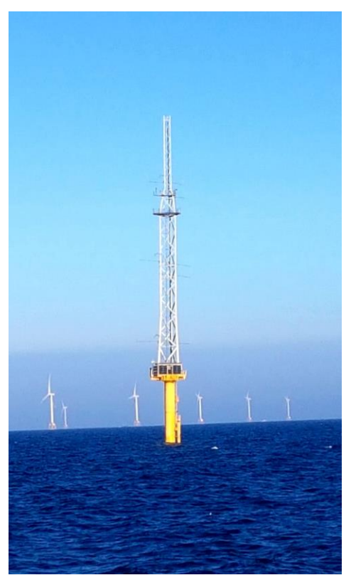
Figure 1 – Photograph of the Meteorological Mast

Updates on when the future surveys, maintenance and decommissioning phase will take place and the vessel(s) involved in the work will be provided through future NtMs.